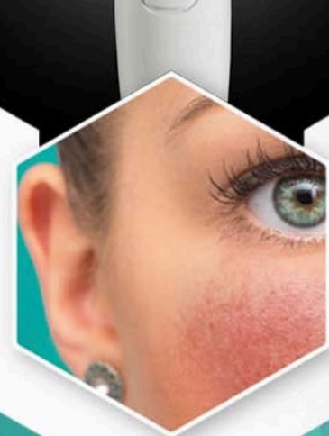
ROSACEA + DISCOLORATION