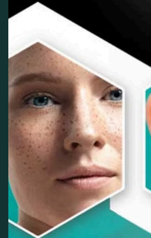
POTS + FRECKLES